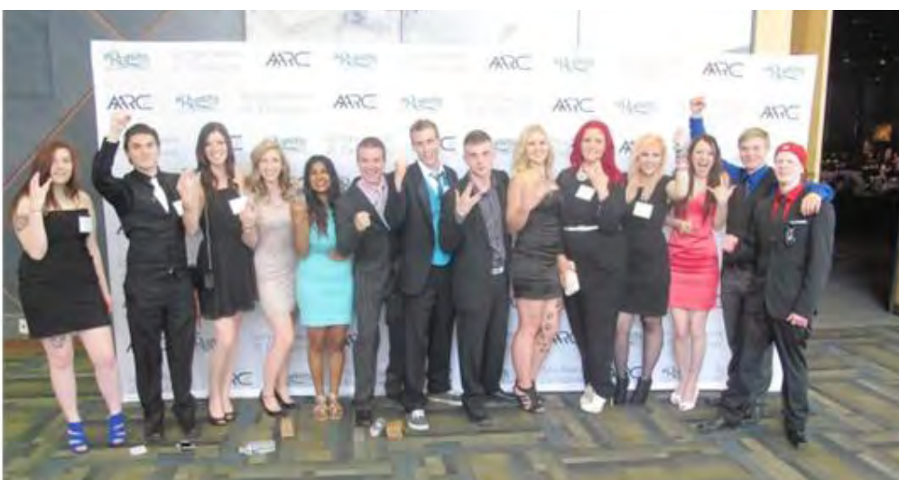
The AARC Gala benefit dinner was a resounding success and attended by 700 guests, some of whom were AARC graduates, pictured above.